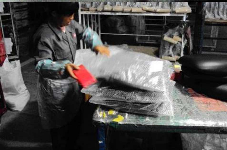
Packing the seat cushion, right.