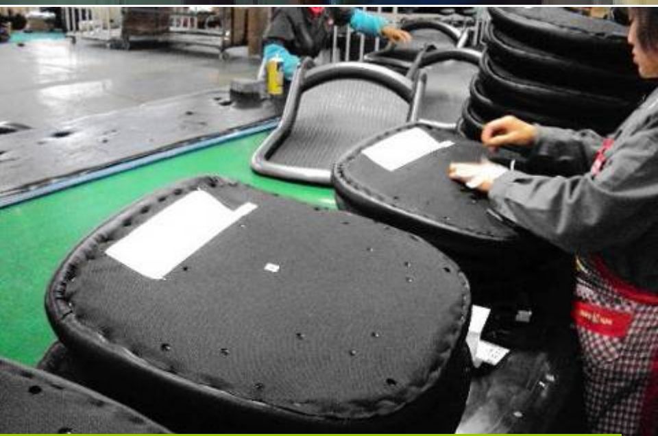
The factory worker are cleaning the seat cushion.right.