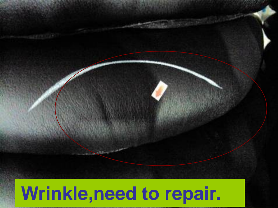
Wrinkle, need to repair.