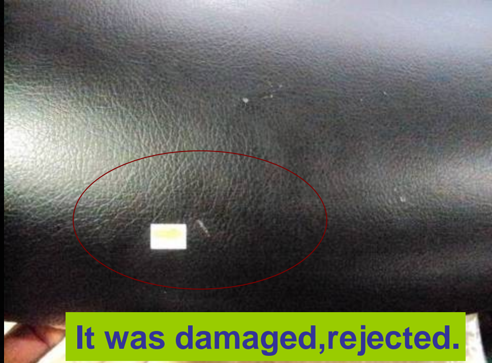
It was damaged, rejected.