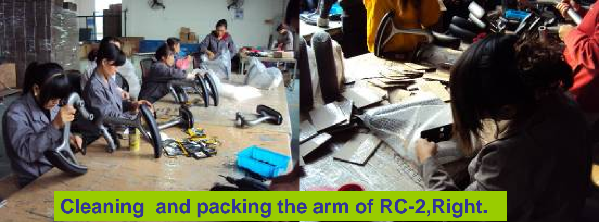
Cleaning and packing the arm of RC-2,Right.