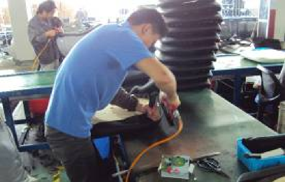
The factory worker are making the seat cushion of RC-2.